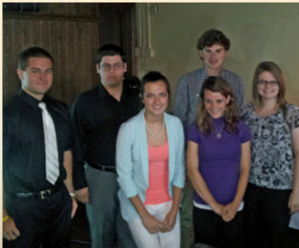
2013 Scholarship awardees at May 2013 meeting